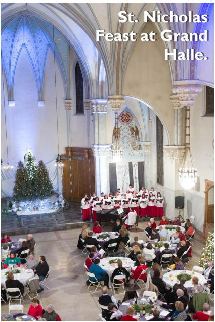
St. Nicholas Feast at Grand Halle.

Meanwhile, the Arts Coalition of the Alleghenies continued to promote arts events across the three-county area.