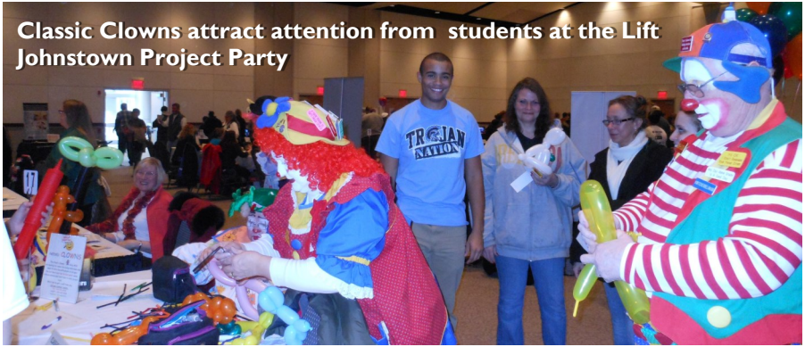
Classic Clowns attract attention from students at the Lift Johnstown Project Party

Greenhouse Park hosts dozens of popular community events, as well as the Stonycreek Rendezvous, which attracts 1,200 people for one of the most acclaimed whitewater festivals in the East.