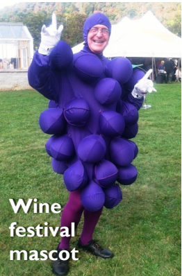
Wine festival mascot

GPS development, like many Lift Johnstown projects, was funded by the Community Foundation for the Alleghenies.